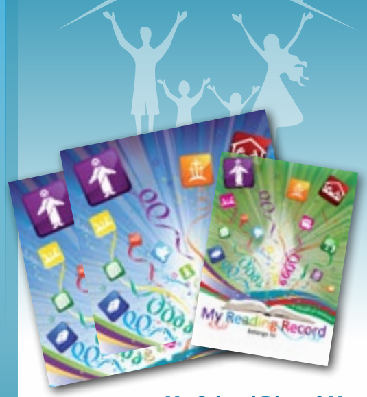
My School Diary &My Reading Record

Limited stock still available for My School Diary 2011 & My Reading Record