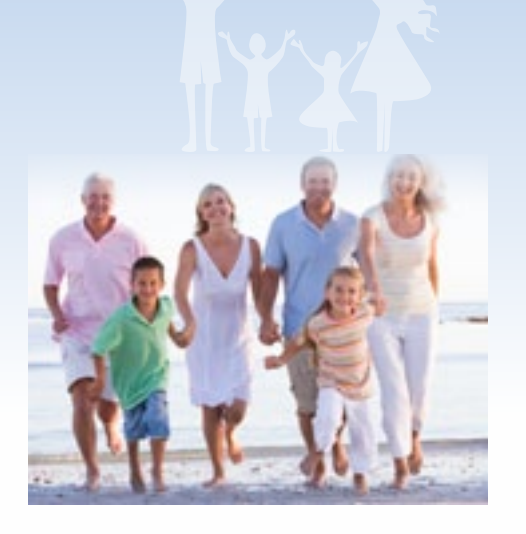
Visit our Store Books & Resources for Catholic Families, Schools & Parishes